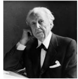
FRANK LLOYD WRIGHT