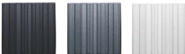
SOUNDWAVE® SKY Acoustic Panel By Marre Moerel